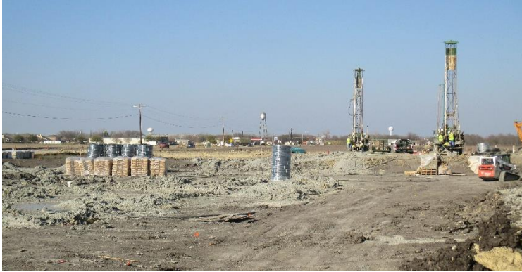
Lagos Elementary School located on FM 973