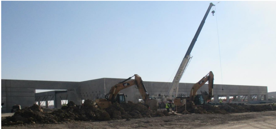
Capital Wright Distributing located on Highway 290 East