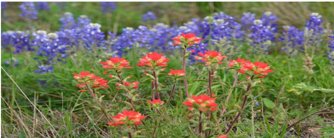
Photo taken by Warren Capps April 13, 2013 near Fredericksburg, Texas

Did you know..... that the official Texas state flower is the Bluebonnet ( Lupin Texensis ). It became the state flower in 1901 and in 1971 all 6 species of Bluebonnets were given the status of “state flower”. The Texas Department of Transportation uses the flower extensively in its roadside beautification program as well as erosion control. It blooms from March – May and has a usual height of 12 inches. It makes its most impressive display during years of abundant winter rains.